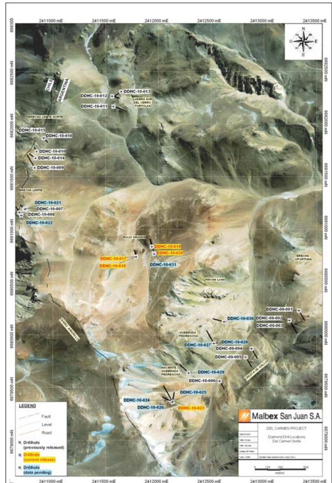
Del Carmen Norte: map showing 9 km 2 alteration zone and drill hole locations