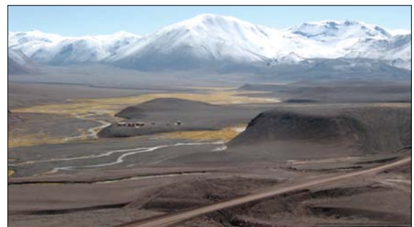
Despoblados Camp with Barrick's Veladero mine road in foreground