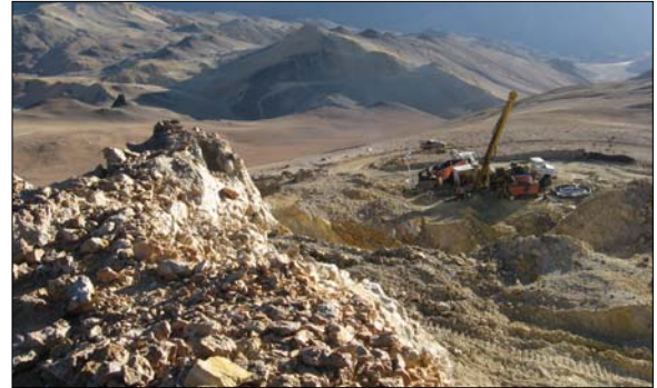
Diamond drilling at Brecha Limite on Del Carmen property