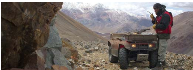
Reconnaissance mapping and sampling at Amarillos