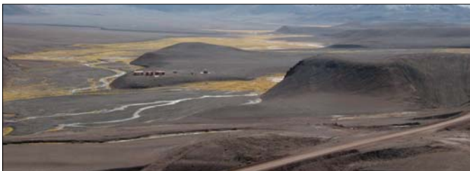
Despoblados Camp with Barrick's Veladero mine road in foreground