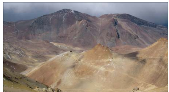
Vuggy silica ridges and widespread alteration at Del Carmen