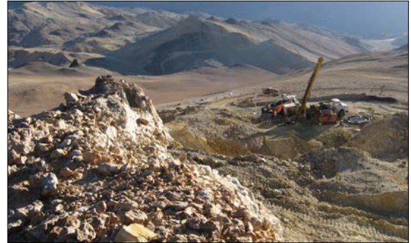
Diamond drilling at Brecha Limite on Del Carmen property